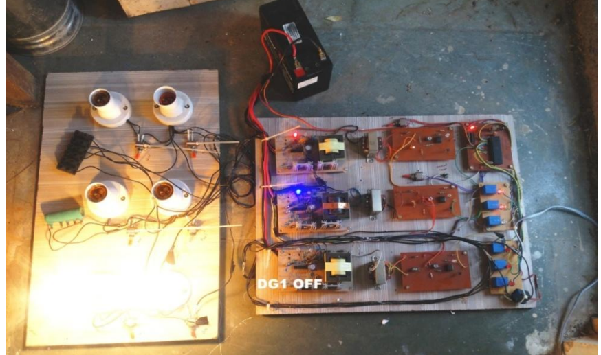
Fig.4. Overload on DG1 shifted to grid