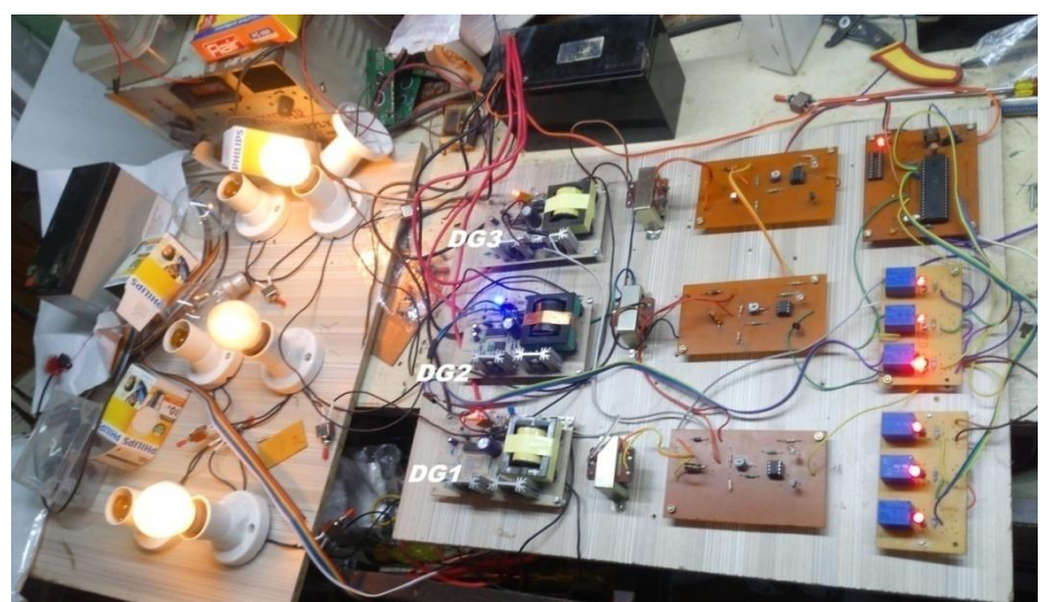
Fig. 3. Hardware model showing three single phase inverters as DGs