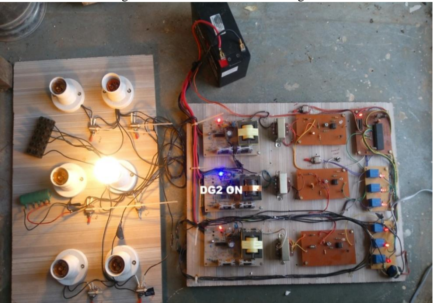
Fig. 5. DG2 during normal operation