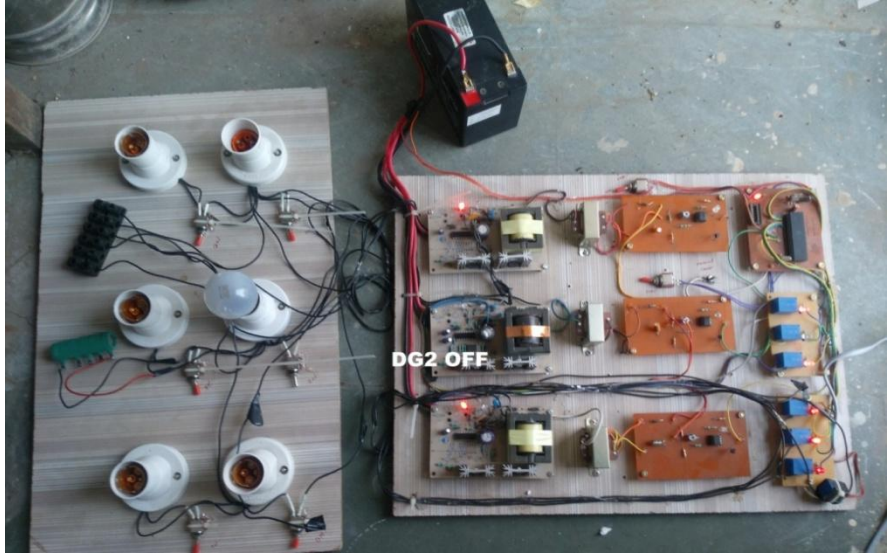
Fig. 4. Short circuit fault occurred on DG2